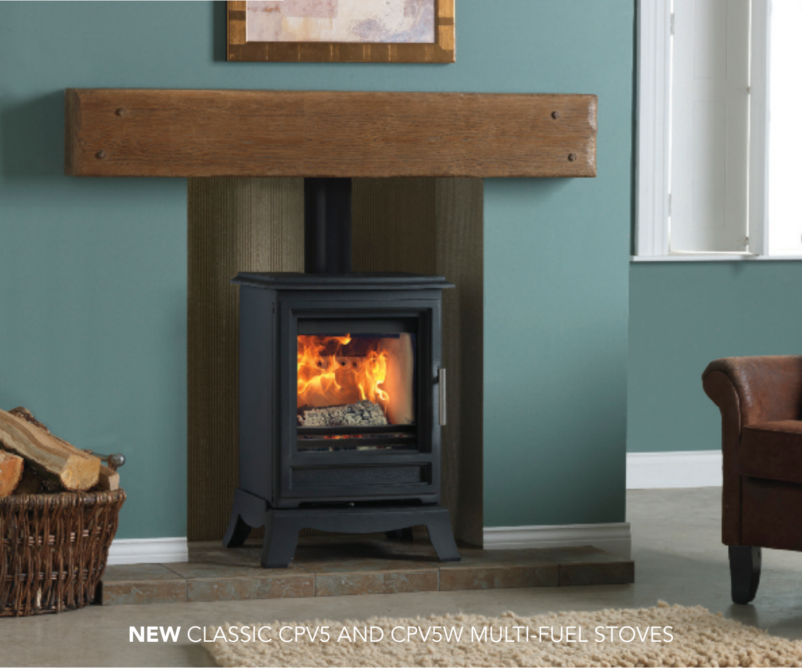
NEW CLASSIC CPV5 AND CPV5W MULTI-FUEL STOVES