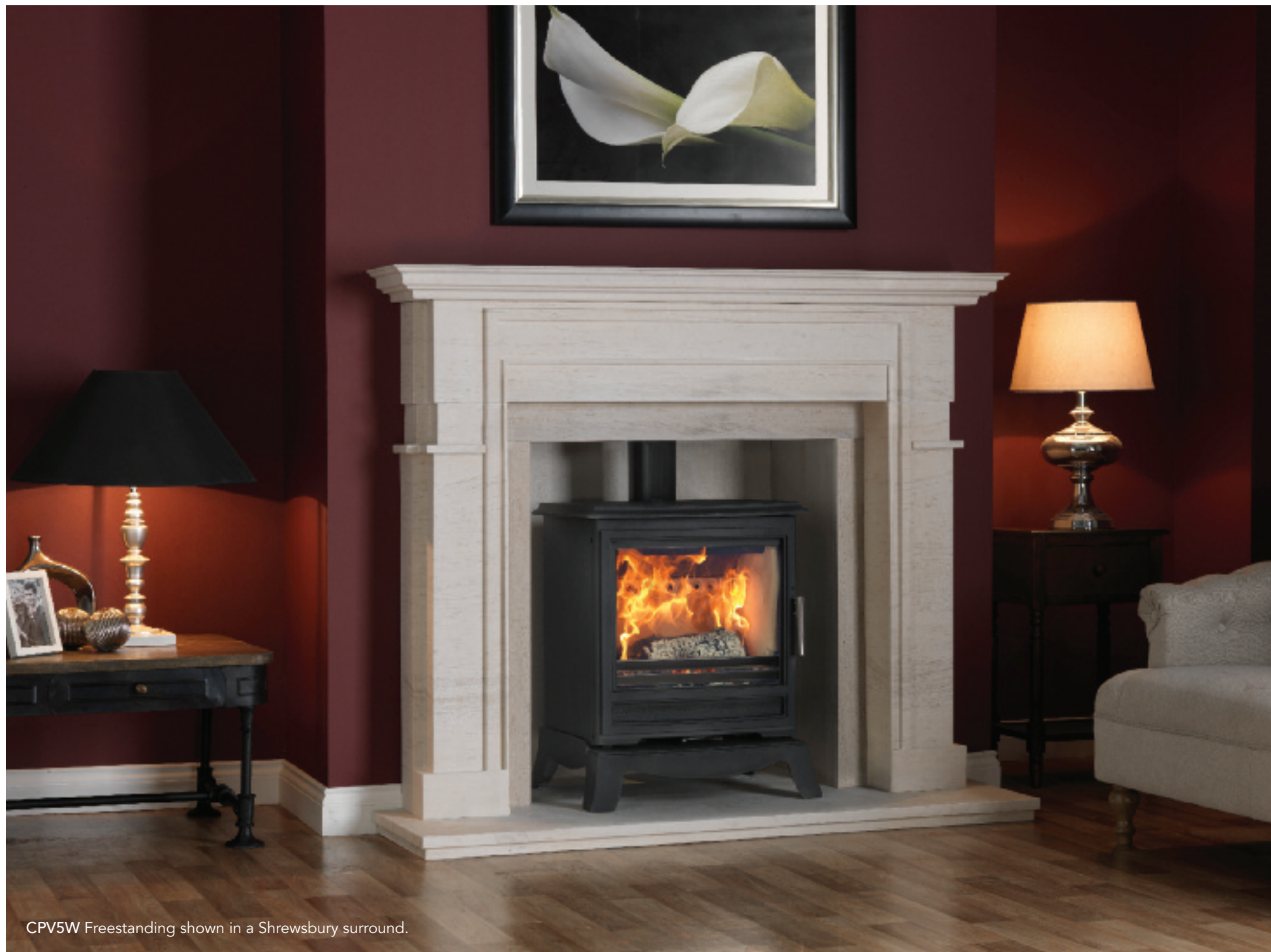
CPV5W Freestanding shown in a Shrewsbury surround.