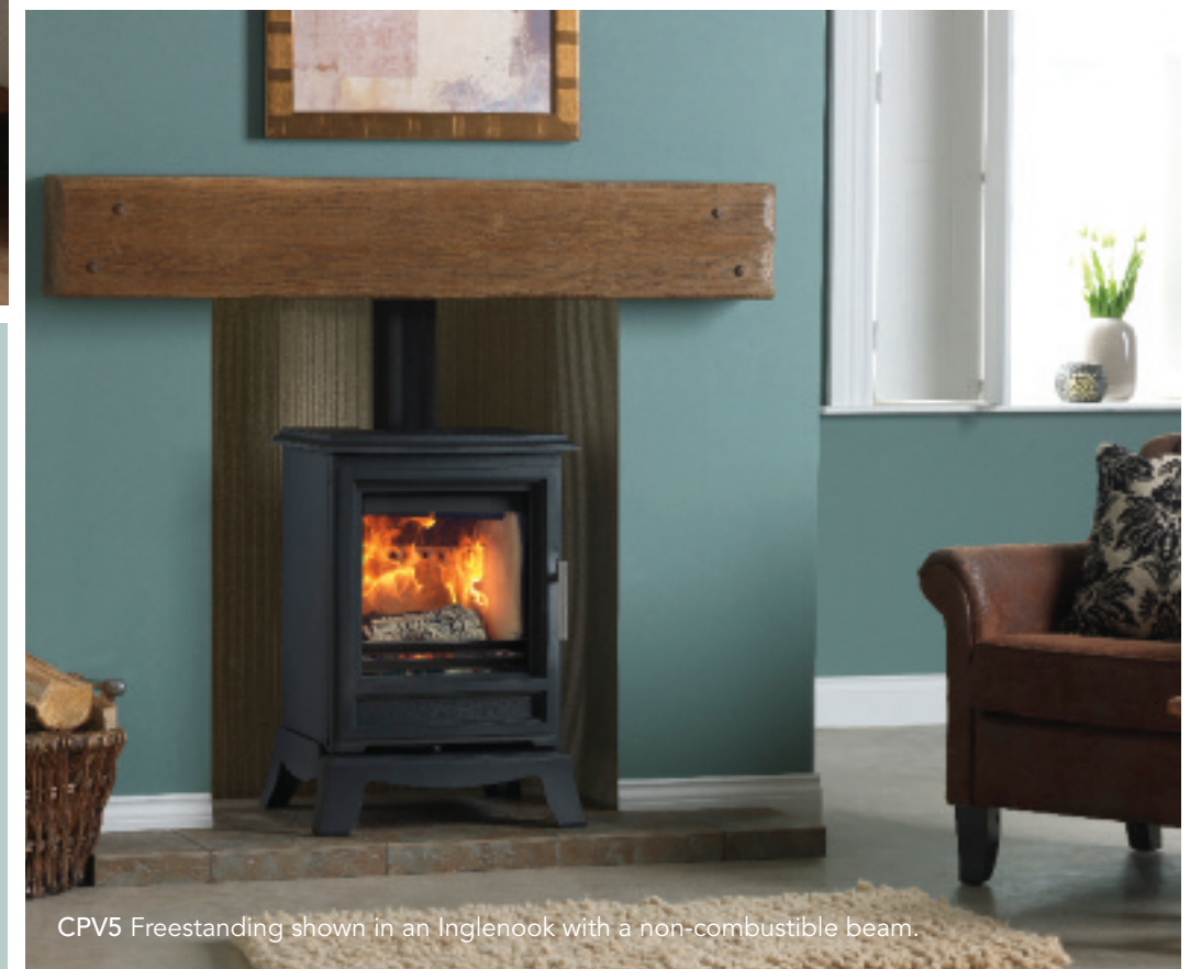
CPV5 Freestanding shown in an Inglenook with a non-combustible beam.